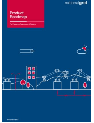
This document sets out the actions to be taken forward for frequency response and reserve.